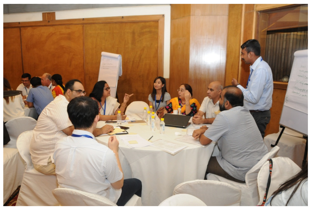
Group work (ongoing)

Three group work sessions were held on the following topics: 1) Investment and Disinvestment, following the lecture on the importance of topic selection, 2) Scope of HTA, and 3) Brainstorming Session for Topic Selection Process in India. The group work sessions were designed to be the backbone of the workshop with group work leads developing the materials for participants and facilitators to refer to. Originally,