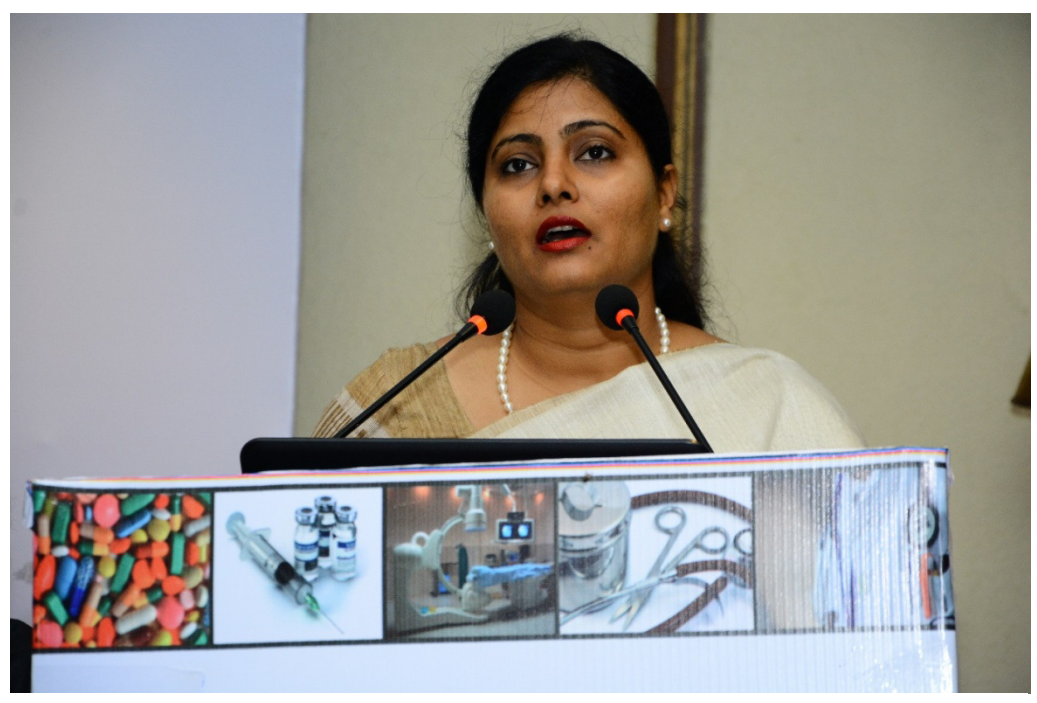
Smt. Anupriya Patel, Hon'ble Minister of State for Health and Family Welfare, Govt. of India

The new National health protection policy was discussed as soon be unveiled and adopted and that this marks an important and opportune moment in time to look to how to best plan health for a sustainable future. Priority setting was raised as a highly important area of focus for India, whereby the question of how to provide best possible health care, including treatment, preventive and promotive healthcare within the limited resources that India has available must be considered. HTA was discussed as the tool to achieve more effective priority setting. Both National and international examples were discussed to highlight the use of HTA towards more effective priority setting. The National Technical Advisory Group on Immunization (NTAGI) was discussed as a successful national example of a program which translates evidence to policy and makes recommendations to the Government regarding which vaccines should be paid for and when and how they should be used. This is an example of well thought out evidence-based policy being practiced in India. Examples from NICE in the UK and HTAP in Thailand were also discussed, and both Dr. Soumya and Smt. Anupriya raised the importance of working with these countries in order to engage in meaningful knowledge exchange and learn from International partnerships.