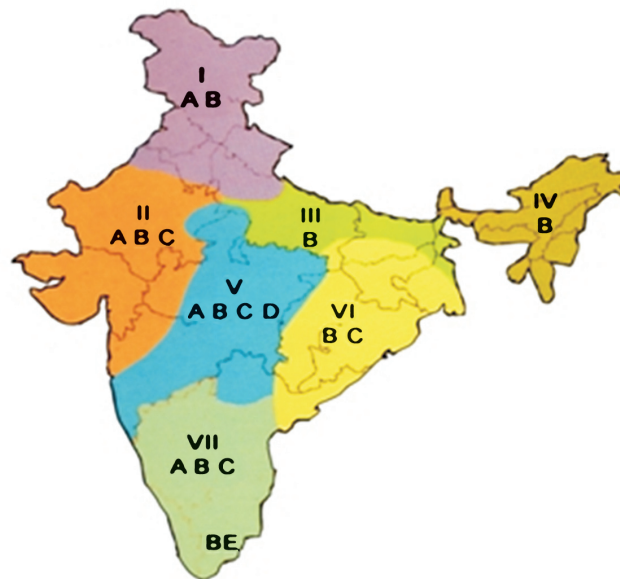
Fig. 3. Map of India showing geographical distribution of An. culicifacies complex (sibling species A, B, C, D, and E), and stratification (Divisions I-VII) for vector control options.

The pre-mating reproductive isolation between sibling species was further substantiated by post-mating isolation mechanisms marked by unidirectional fertility/hybrid male sterility/ reduced fertility/ atrophied reproductive organs in reciprocal crosses between species A/B, and A/C. Reciprocal crosses between species B and C, however, produced fertile F1 hybrid males and females 33,38,39 . In addition to these methods, these siblings could also be identified with reasonable accuracy by mitotic karyotype Y-chromosome